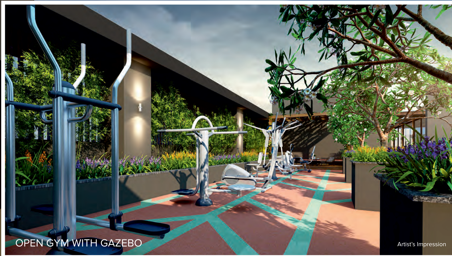
OPEN GYM WITH GAZEBO